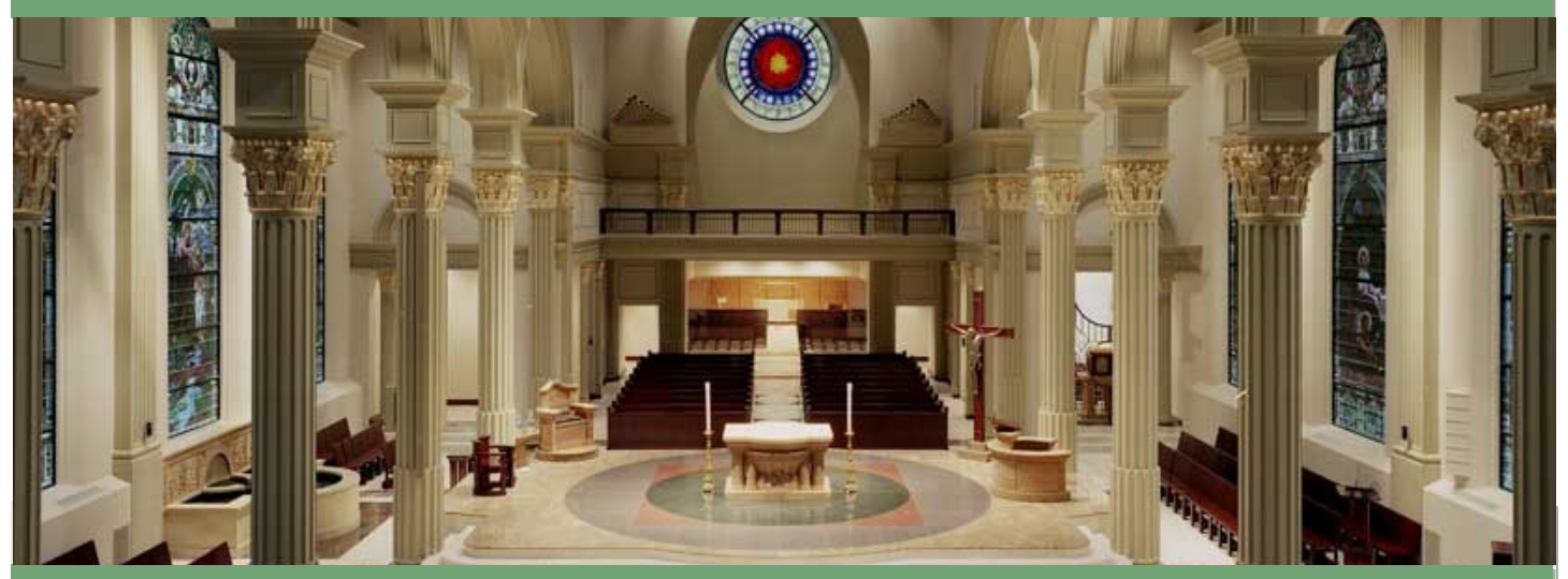
Eleven Sunday in Ordinary Time