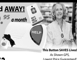
This Button SAVES Lives! As Shown GPS, Lowest Price Guaranteed!