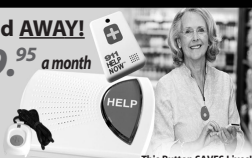
This Button SAVES Lives! As Shown GPS, Lowest Price Guaranteed!