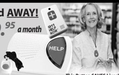
This Button SAVES Lives! As Shown GPS, Lowest Price Guaranteed!