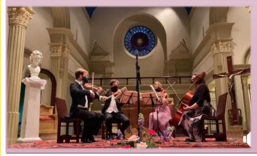
The Kansas City Beethoven Cycle: The Opus 76 Quarter September 19 at 8:00 pm Strictly limited capacity. Please visit our website for more information: https:// kcgolddome.org